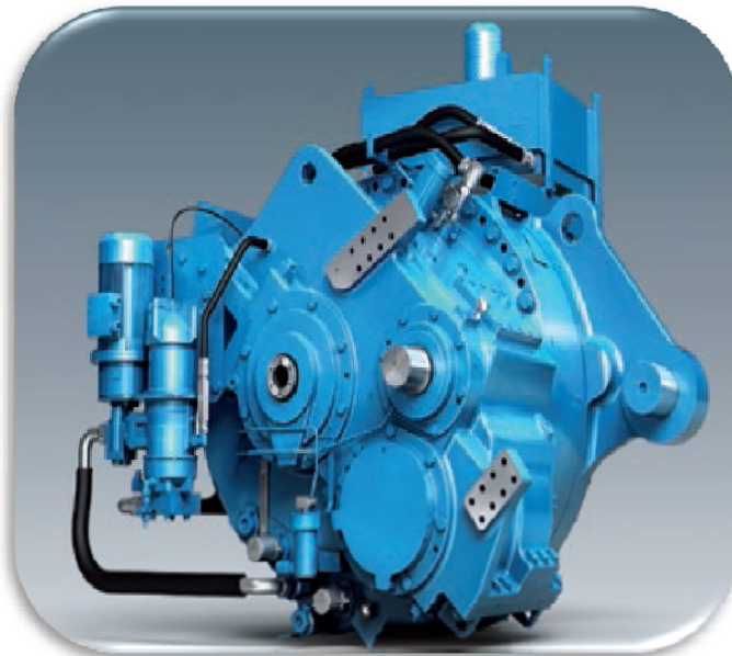
<Gearbox Cooling Hose>